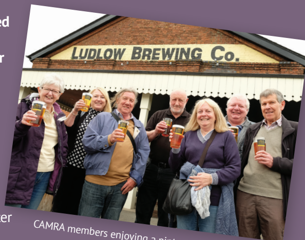
CAMRA members enjoying a pint...

Along with other Bridgnorth CAMRA members we visited the Railway Shed in late April and the first thing that strikes you is the enormity of the building. It was early afternoon and the bar and outside drinking areas were already packed with thirsty customers enjoying the full range of 6 real ales.