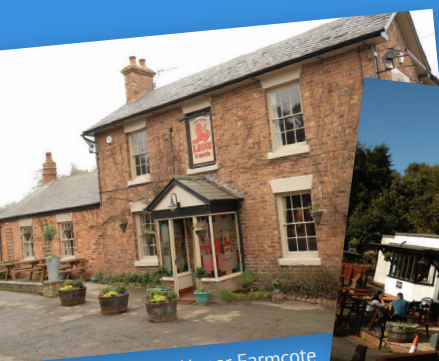
Lion O'Morfe Upper Farmcote