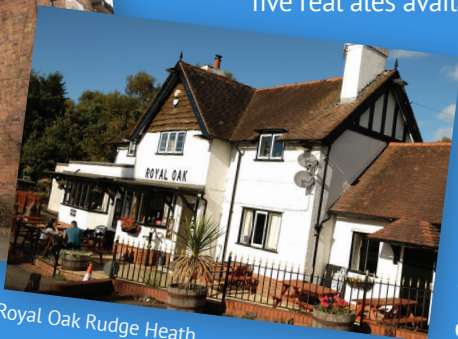
Royal Oak Rudge Heath